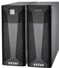
Battery Cabinets. (Optional)